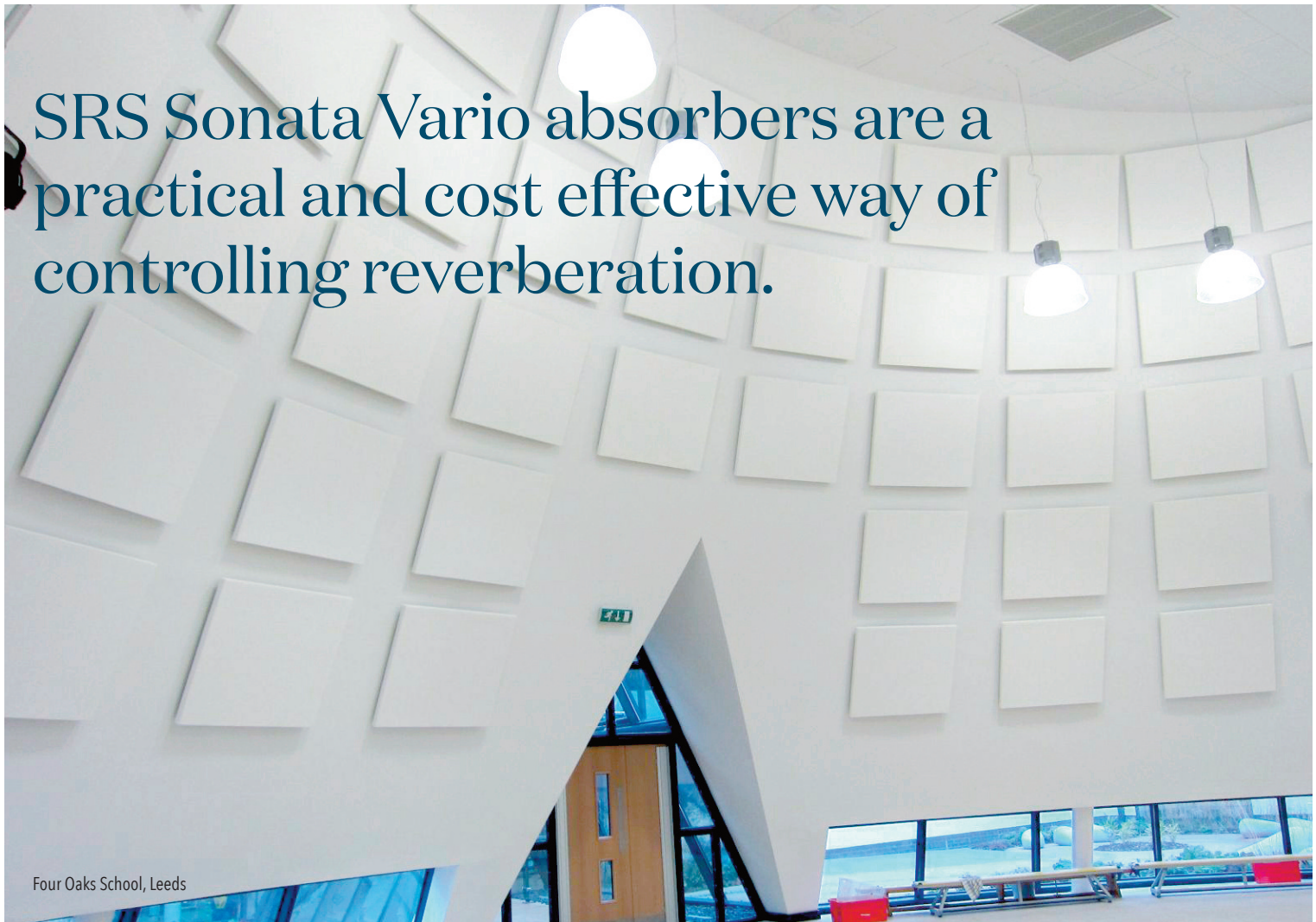
Four Oaks School, Leeds

SRS Sonata Vario absorbers are a practical and cost effective way of controlling reverberation.