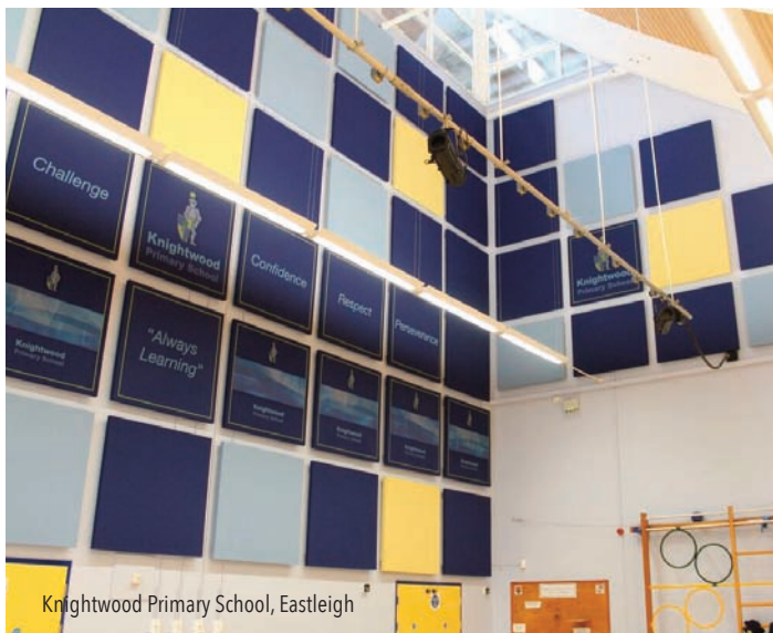
Knightwood Primary School, Eastleigh